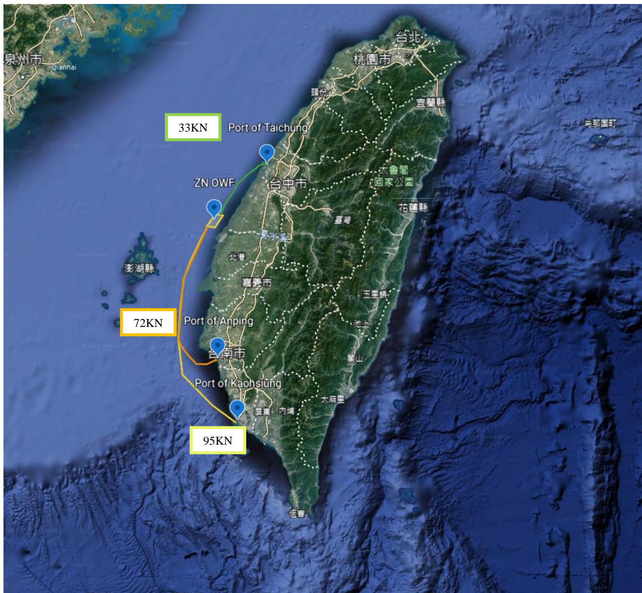
圖2、本計畫船舶航行路線 Figure 2 The planned sailing route of ZN project

All vessels mobilised for this plan are expected to arrive at Kaohsiung Port and Taichung Port from April to May in 2023. After customs clearance and mobilisation operations at the ports, they will sail to Zhongneng Offshore Cable Corridor and Wind Farm Site to perform operations. During the cable installation, most of vessels will sail in and out Taichung Port, in some cases vessels will also sail to Kaohsiung Port or Anping Port for supply operations. In case of an emergency or weather sheltering requirements, Taichung Port and Kaohsiung harbor will be considered as emergency harbors of refuge.