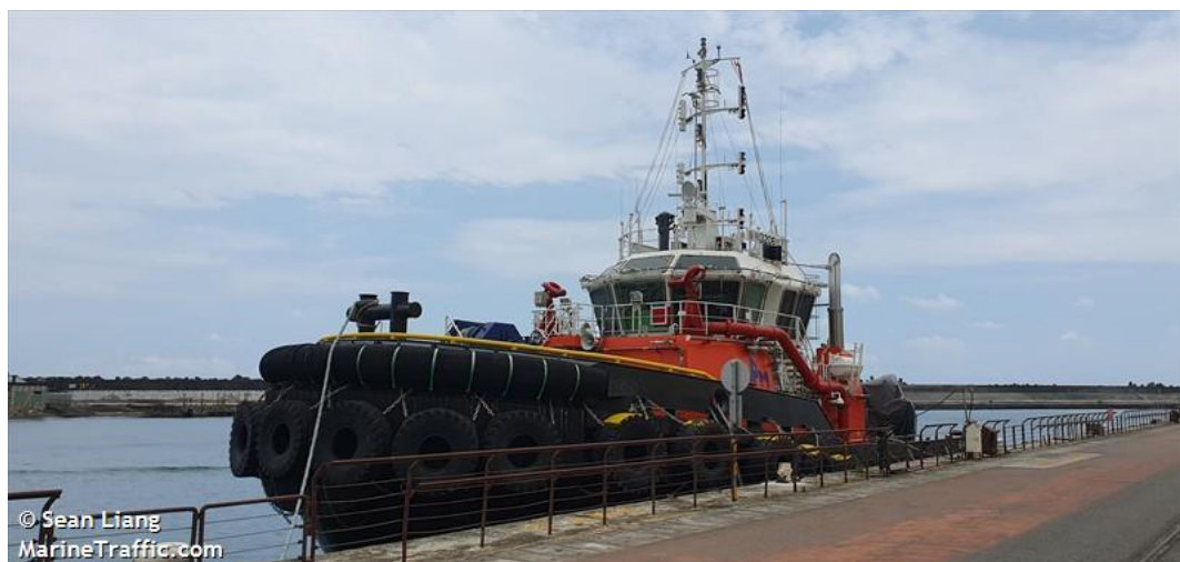
臺港 13206 號彩色圖片