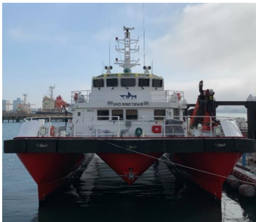
臺港 22605 號彩色圖片 1