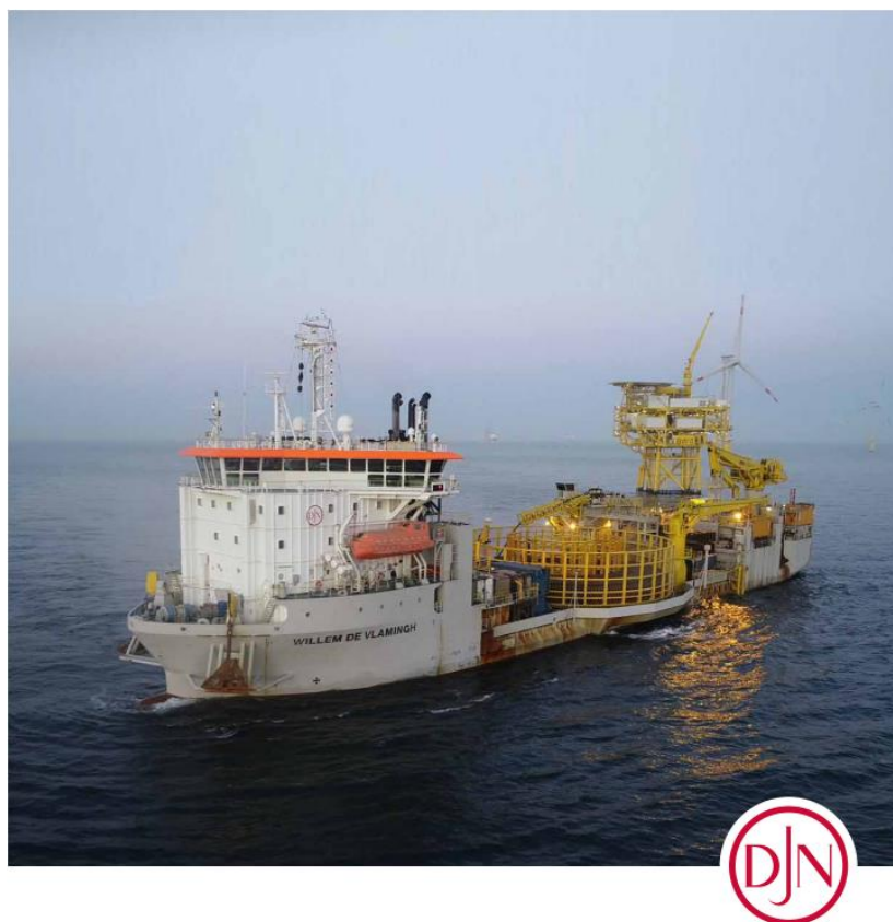
威廉 Willem de Vlamingh 彩色圖片