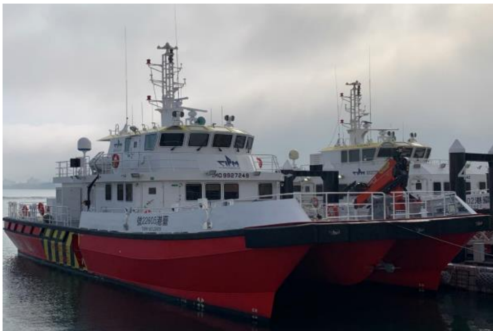
臺港 22605 號彩色圖片 2